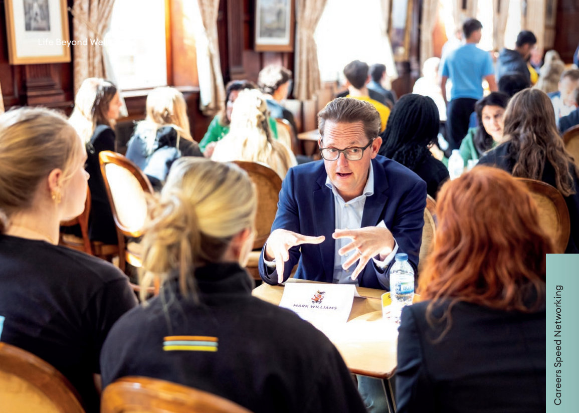
Careers Speed Networking