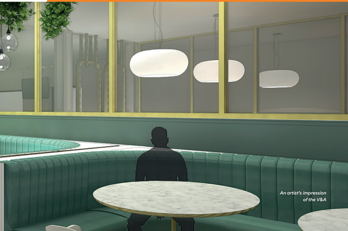
An artist's impression of the V&A

Regarded by many as the beating heart of Wellington, the V&A café acts as the focal point for informal gatherings, tutor group meetings or simply casual socialising. Popular with pupils and staff alike, its position in the centre of College ensures that few Wellington days are complete without a visit to the V&A.