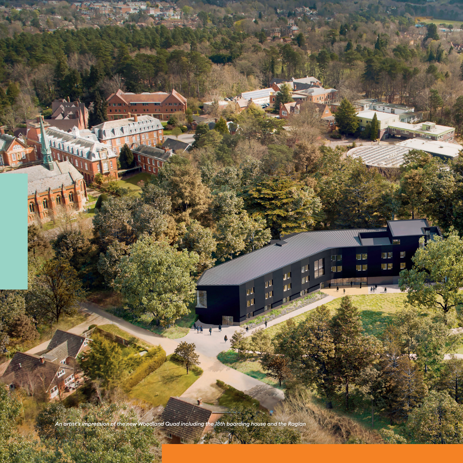
An artist's impression of the new Woodland Quad including the 18th boarding house and the Raglan